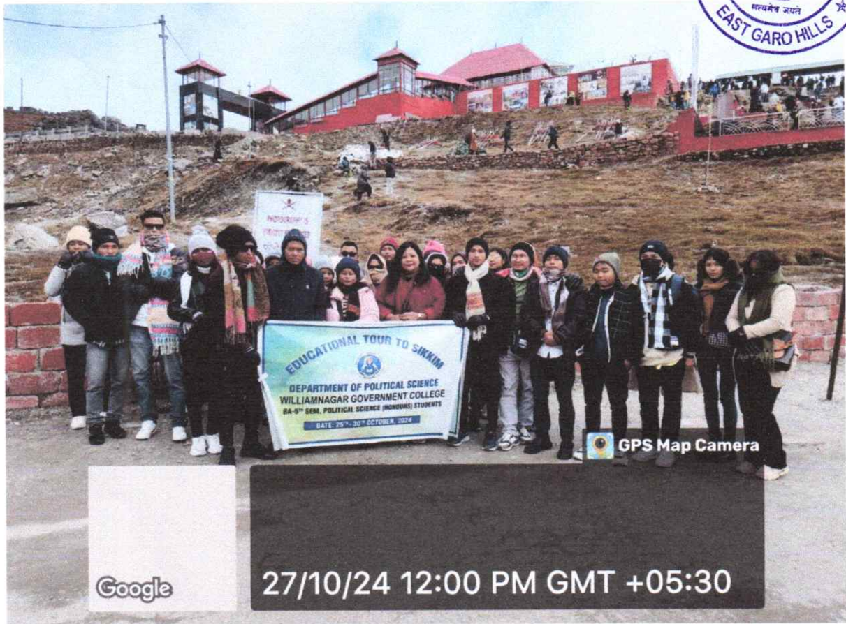
Group photo taken at Nathu-La Pass